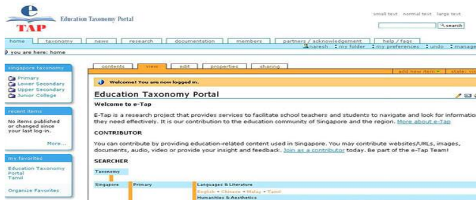
Figure 3. Snapshot of the Educational Taxonomy Portal (ETaP)

To shorten this gap by providing a localized learning object repository for Singapore schoolteachers and students, the Educational Taxonomy Portal (ETaP) project was initiated at the School of Computing, National University of Singapore in 2004. ETaP was targeted at the Singapore Education Community, with the aim of providing free-of-charge services to facilitate schoolteachers and students to contribute, search, navigate and retrieve education-related content effectively. A taxonomy based on the prescribed education curriculum would help in easy browsing. Improved navigation and search quality should give rise to more innovation and effectiveness, and enhance the efficacy of Knowledge Management in Singapore (Agarwal, Poo and Goh 2005).