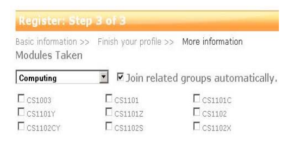
Figure 1: Profile gathering during registration.

By capturing user profile, the system will be able to personalize each user's screen. For example, looking at the list of interest of the user, we are able to generate the list of initial questions to show on the Q&A page. This is especially important for showing content which are relevant and interesting in user's perspective.